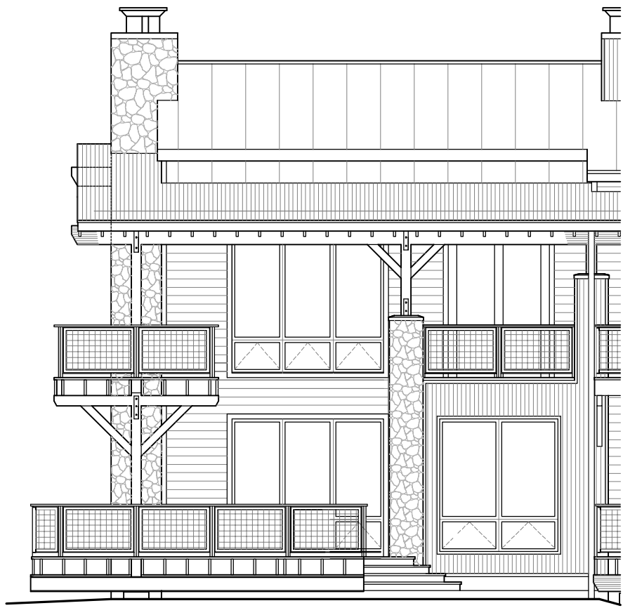
A CREEK ELEVATION 1/8" = 1'-0"