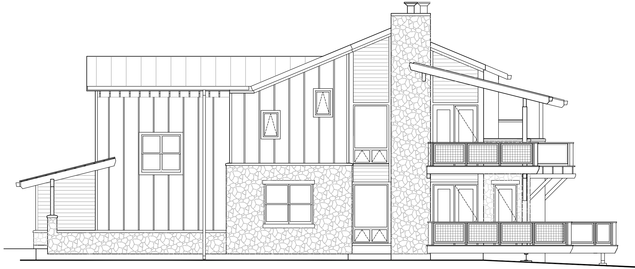
A END ELEVATION