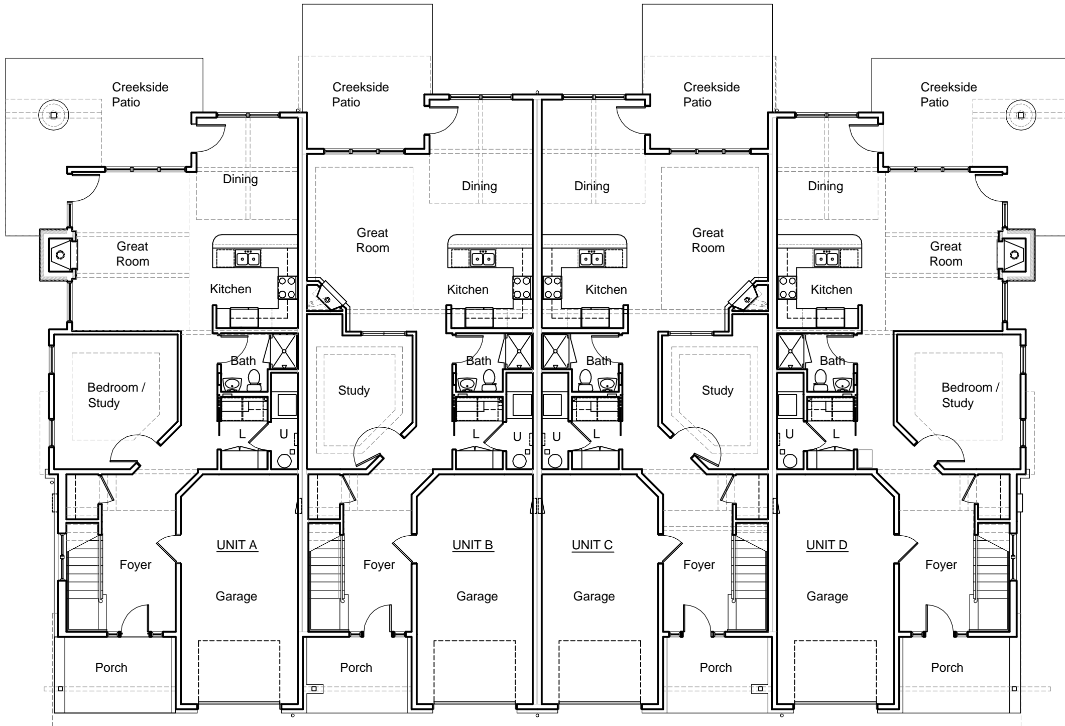
A GROUND FLOOR PLAN