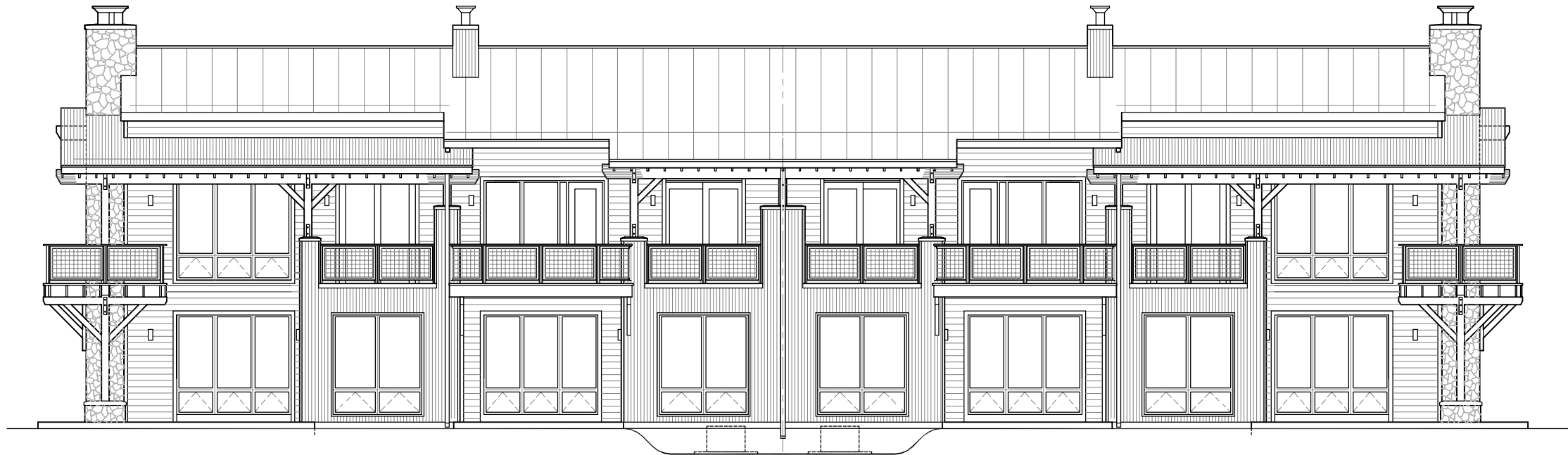
B CREEK ELEVATION