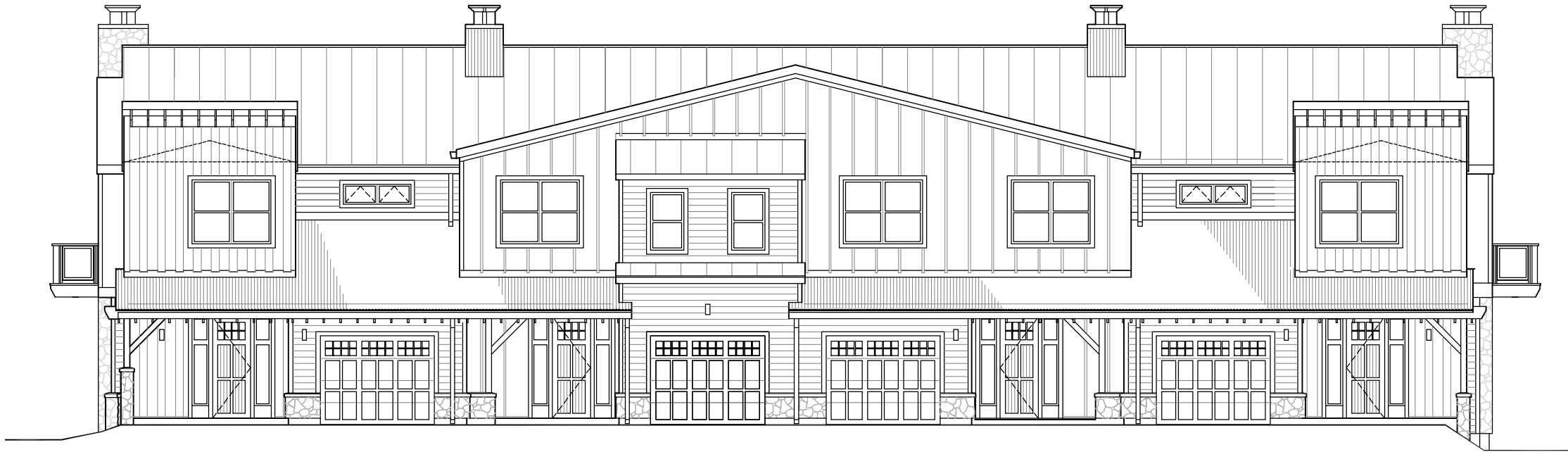
A STREET ELEVATION